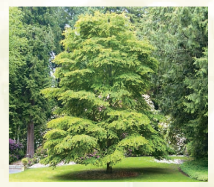
The graceful Katsura tree

We've had some whoppers of winter storms the past few years and on the eve of our storm season, it's not a bad idea to think about our garden trees and which ones might be susceptible to storm damage. Juneau says the most important thing to think about when surveying trees for potential hazards is the individual history. Ask yourself if the tree has suffered damaged roots from installation of utility or septic lines. You'd be surprised how far out roots can spread away from the trunk and the ends of the branches, especially in shallow soils. Does the ground around the base of the tree get saturated with water from downspouts or driveway runoff? Even healthy trees can fall over if the ground underneath is too wet. Is a tree the lone remainder of a group of