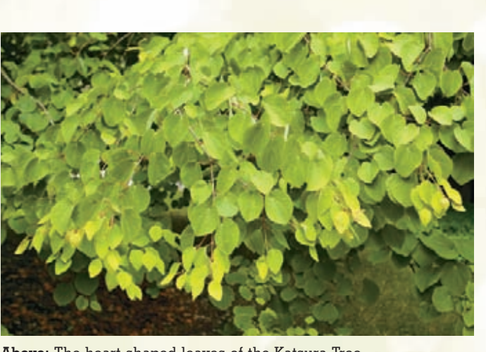
Above: The heart-shaped leaves of the Katsura Tree Below: The unique shape of the Tulip Tree leaf

7571 NE Dolphin Drive Bainbridge Island 206.842-7631