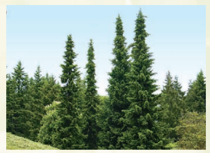
Above: The Serbian Spruce (Picea omorika) are stately evergreen spires. Below: Fernleaf Maples outside a Japanese garden