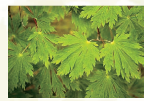
The leaves of the Fernleaf Maple will turn colorful in the fall.

Every tree species has its strengths and weaknesses, locations and exposures where it can excel or struggle. You may have heard the saying, "Right plant, right place." This applies to trees and proper planning makes for healthy trees. Allowing enough room for a tree to spread and mature is one consideration, as is the quality of the soil it will be planted in, the amount of sun or shade it will receive and whether its location is wet